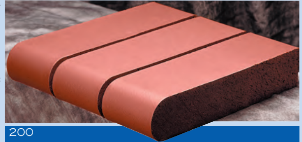
200 PLANTATION RED

We also produce a light grey, Academy Grey and a darker grey - Cobblestone, both of which can be used for a modern architectural/designer appearance.