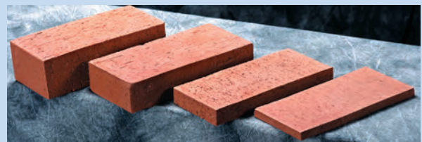
MATCHING BRICK PAVERS

BRICK PAVERS In addition, Marion offers brick pavers which perfectly match our coping products. Our thin pavers BrickTile, are manufactured with a slip resistant smooth wire cut texture in both 1/2" and 15/16" thickness. Our thick pavers - Pee Dee Pavers, are produced with a wire cut texture somewhat rougher than BrickTile, in both 1 5/8" and 2 1/4" thickness. Our wide range of beautiful natural colors and offering of matching coping and pavers provides exceptional design opportunities for your pool and patio.