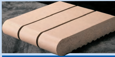
760 ACADEMY GREY