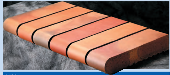
350 AUTUMN LEAVES