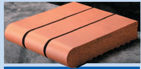
610 SUNLIT EARTH